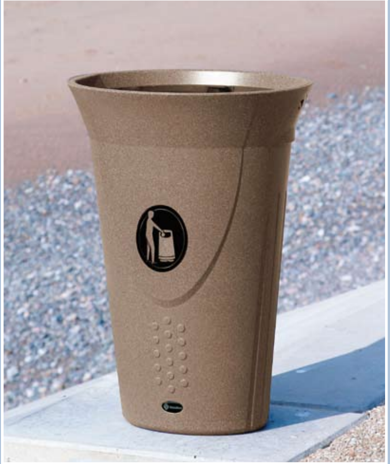
LUNA IN SANDSTONE COLOUR – Ideal for promenade and sea front locations.