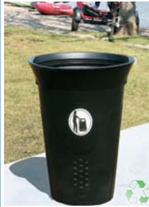
LUNA IN BLACK – Perfect for leisure and recreational environments.