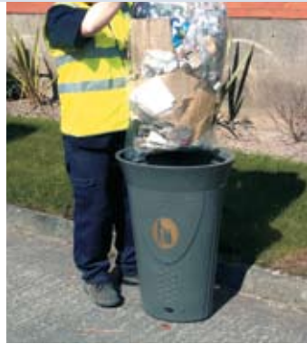
2. Reposition the sack retention bands, then remove the sack from the bin.