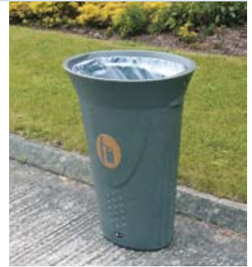
4. Securely clip the sack retention bands back into place within the bin.