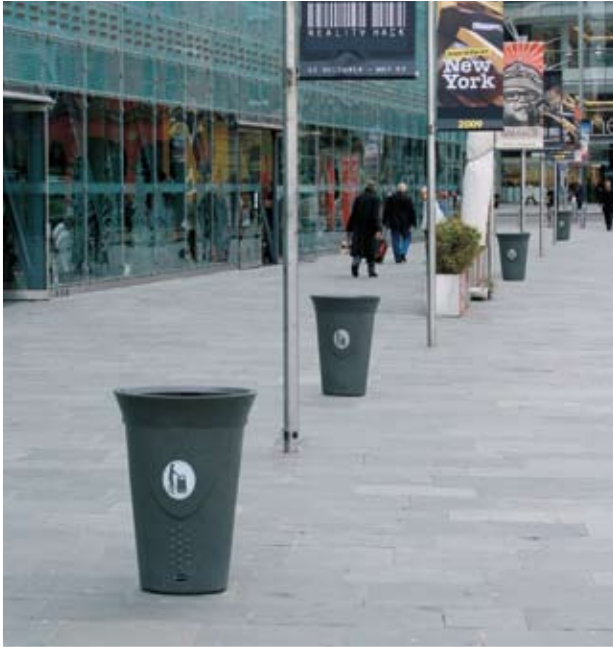
LUNA WITH OPEN TOP – Can be sited in town centres and pedestrianised areas.