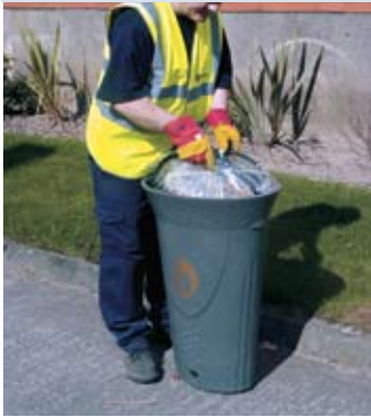
1. Lift the two sack retention bands to release the sack.