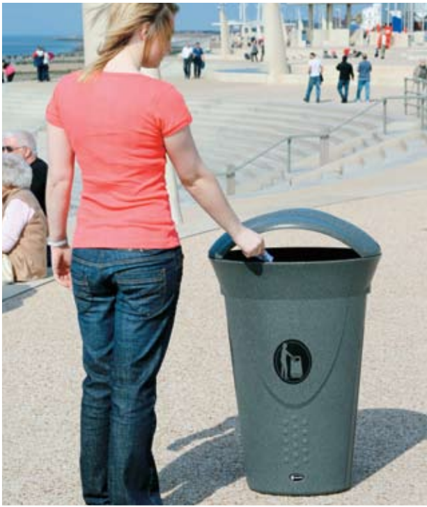
LUNA WITH HOOD – Stylish design complements any contemporary location.