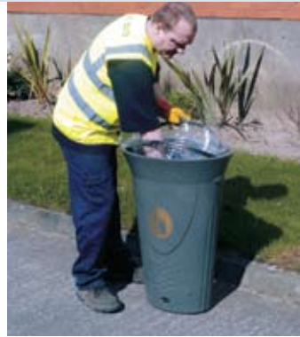
3. Replace with a new sack, positioning the edges around the sack retention bands.